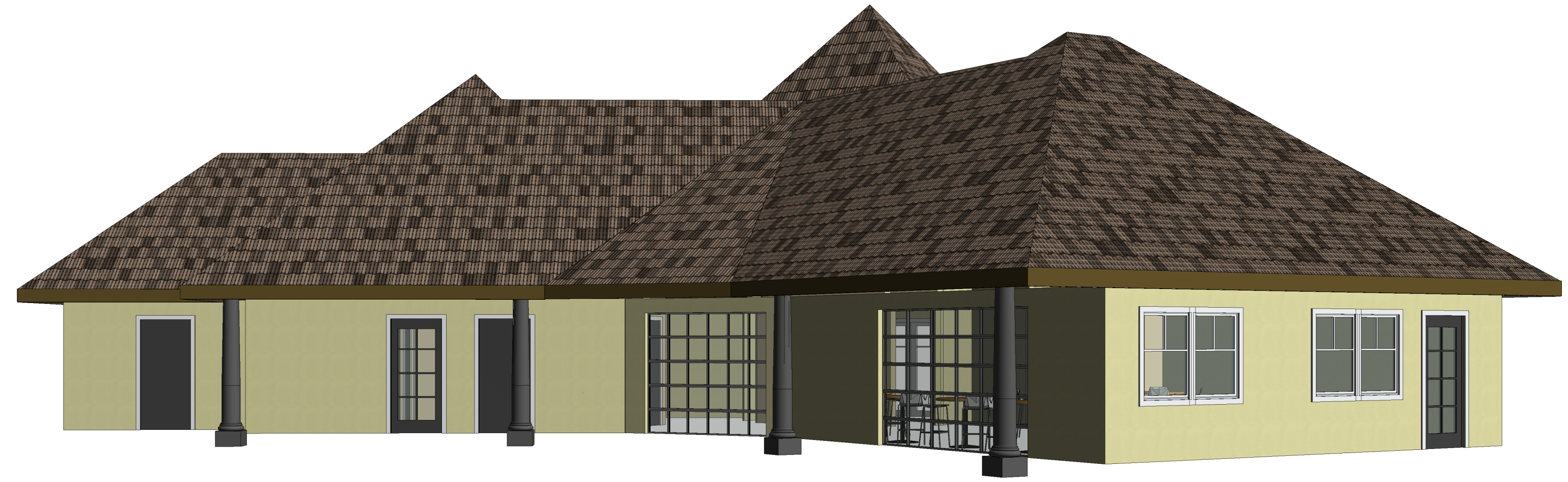
2 3D View